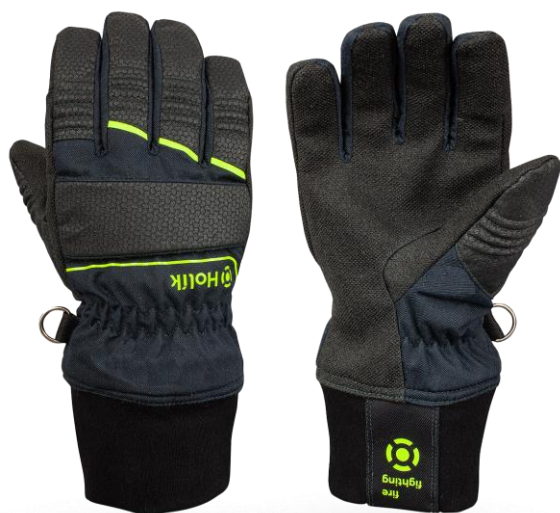
CRYSTAL Flexi Navy Blue

The firefighting gloves with sophisticated reinforcement system for better mechanical and thermal resistance. In addition, the nomex fabric is ceramic coated in exposed areas for increased abrasion resistance. Five different cuff variants and three colors for optimum adaptation to the firefighting jacket.