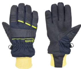
CRYSTAL Short Navy Blue