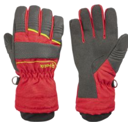
CRYSTAL Evo Red