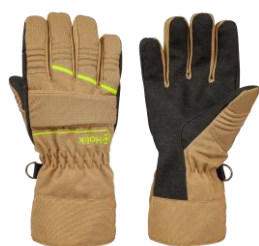
CRYSTAL Easy Beige